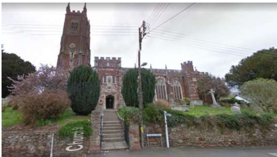
All Saints Church, Kenton, Exeter, EX6 8LU

The Hall has a maximum capacity of 200 people.